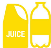
Plastic bottles and containers