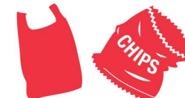
Soft plastics (or take to REDcycle bin)